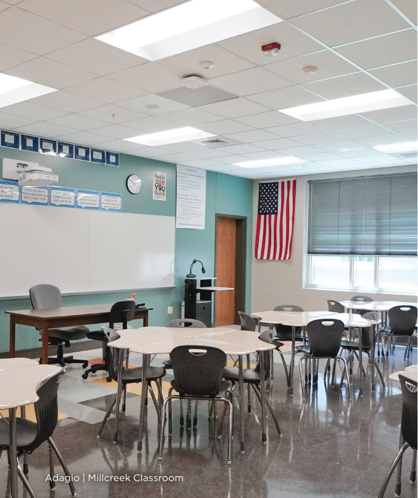
Adagio | Millcreek Classroom