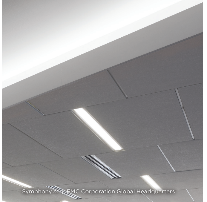
Symphony m | FMC Corporation Global Headquarters