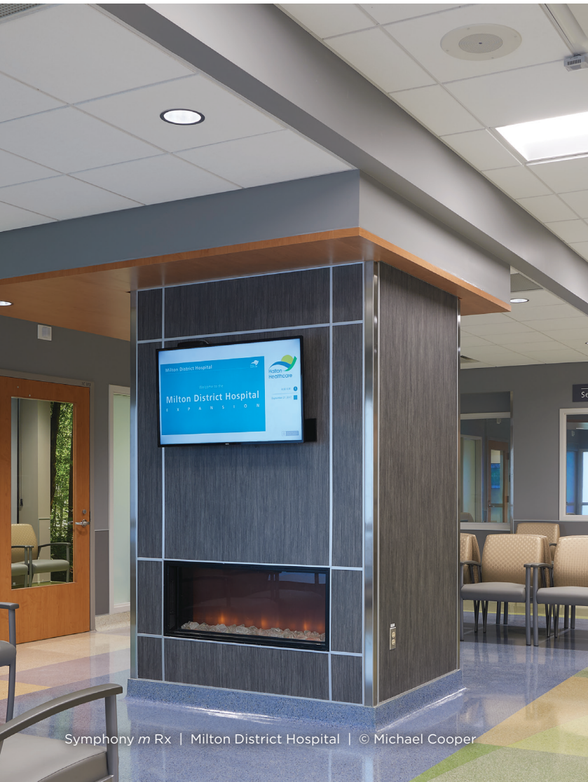
Symphony m Rx | Milton District Hospital | © Michael Cooper

The complete range of durable, cleanable options makes CertainTeed the smart choice for any smooth ceiling application