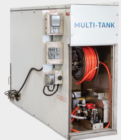
Optional Multi-Tank™ Water Supply System

CertainTeed Machine Works offers a comprehensive line of commercial and residential insulation and fireproofing application equipment, including blowing machines, vacuums and accessories. We provide equipment installation, troubleshooting and repair, custom machine design services, and same-day shipping of spare parts.