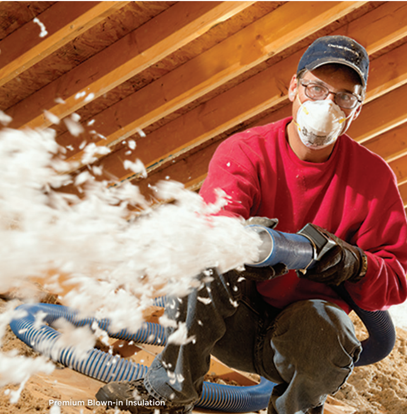
Premium Blown-in Insulation