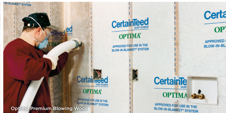
Optima-Premium Blowing Wool