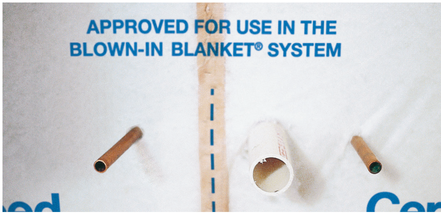
Blown-in InsulSafe SP provides a continuous thermal barrier around water pipes and delivers outstanding acoustic control.