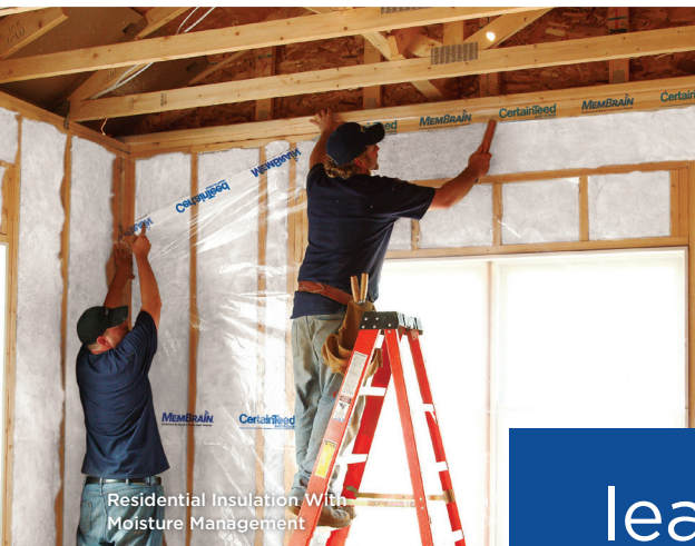
Residential Insulation With Moisture Management