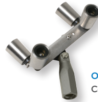
OUTSIDE 90 Code: 640677