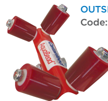
OUTSIDE 90° Code: 405325