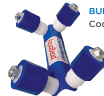
BULLNOSE Code: 405326