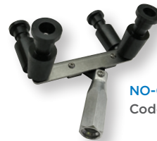
NO-COAT® PRO Code: 640675