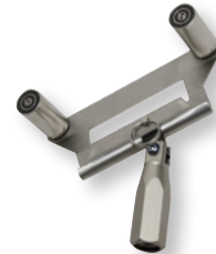
ONE SIDED Code: 640678