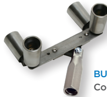
BULLNOSE Code: 639616