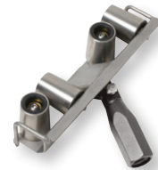
INSIDE 90 Code: 640679