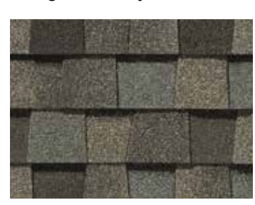
Max Def Weathered Wood