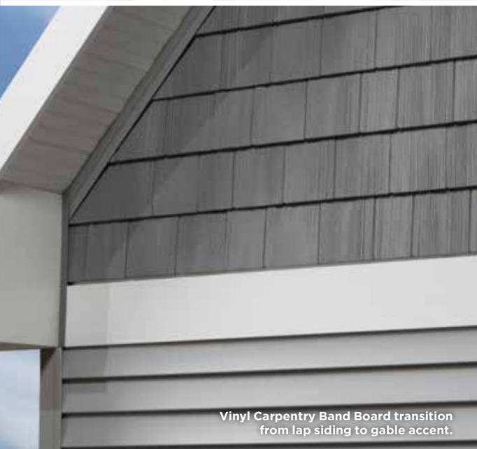
Vinyl Carpentry Band Board transition from lap siding to gable accent.

Siding: Monogram Double 4" Clapboard in Pacific Blue. Trim: Vinyl Carpentry® & Restoration Millwork®.