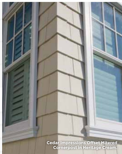
Cedar Impressions Offset Mitered Cornerpost in Heritage Cream.