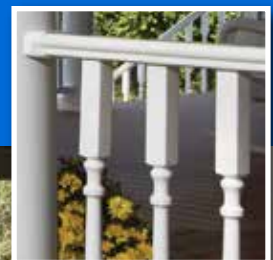
EverNew Kingston railing