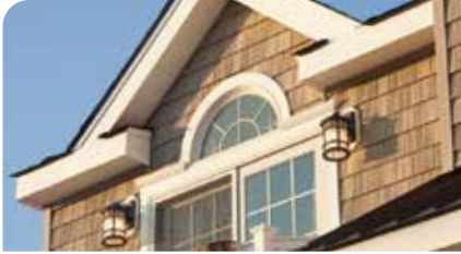
POLYMER SHAKES & SHINGLES

CertainTeed products are designed to work together and complement each other in color and style to give any home a beautiful finished look.