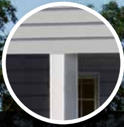
Certa-Snap® Wrap Post Wrap System

Basic trim and soft tones offer a design scheme that unifies the look of your home.