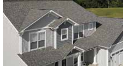
ROOFING AND VENTILATION