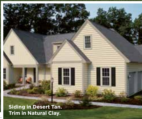
Siding in Desert Tan. Trim in Natural Clay.

Siding: CedarBoards Single 7" Clapboard and Board & Batten Single 8" in Sterling Gray with Cedar Impressions Double 7" Straight Edge Perfection Shingles in Charcoal Gray. Trim: Vinyl Carpentry* & Restoration Millwork* Roofing: Landmark* Shingles in Georgetown Gray.