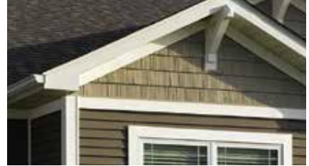
VINYL CARPENTRY® TRIM