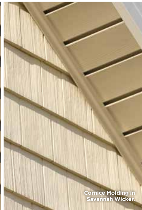
Cornice Molding in Savannah Wicker.