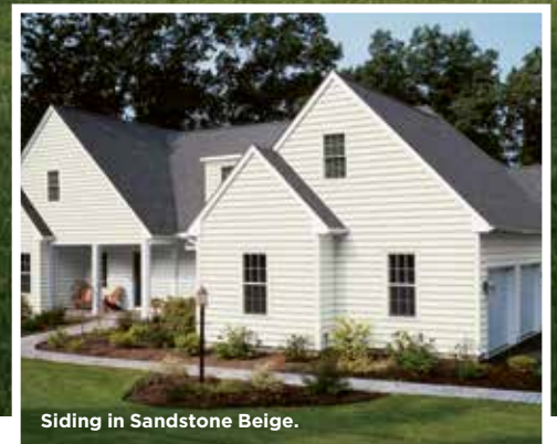
Siding in Sandstone Beige.