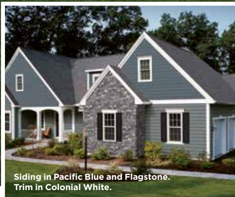
Siding in Pacific Blue and Flagstone. Trim in Colonial White.

Roofing: Landmark Shingles in Georgetown Gray.