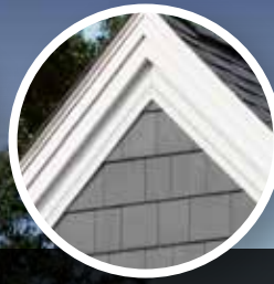
Vinyl Carpentry Cornice Molding and Restoration Millwork Rake Profile