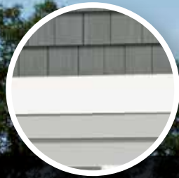
Restoration Millwork trimboard*