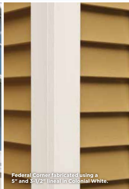
Federal Corner fabricated using a 5" and 3-1/2" lineal in Colonial White.