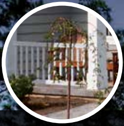
Oxford railing with square balusters in white

Complete freedom of expression with Restoration Millwork, Cedar Impressions, Vinyl Carpentry accessories, and EverNew railing systems. Definitive color differences on the various shapes and lines on your home convey eye-catching curb appeal.