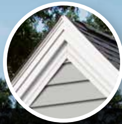
Vinyl Carpentry* Cornice Molding with Aluminum Rake