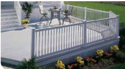
DECKING AND RAILING