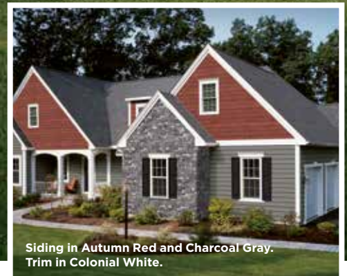
Siding in Autumn Red and Charcoal Gray. Trim in Colonial White.