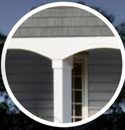
Restoration Millwork Classic Column Wraps