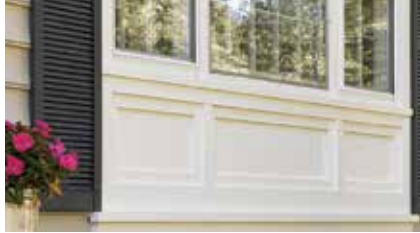
PVC EXTERIOR TRIM & BEADBOARD