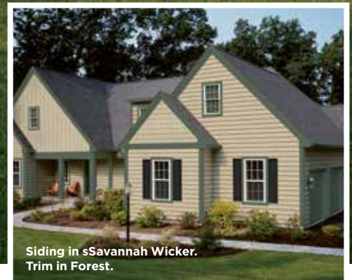
Siding in sSavannah Wicker. Trim in Forest.