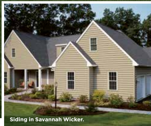
Siding in Savannah Wicker.