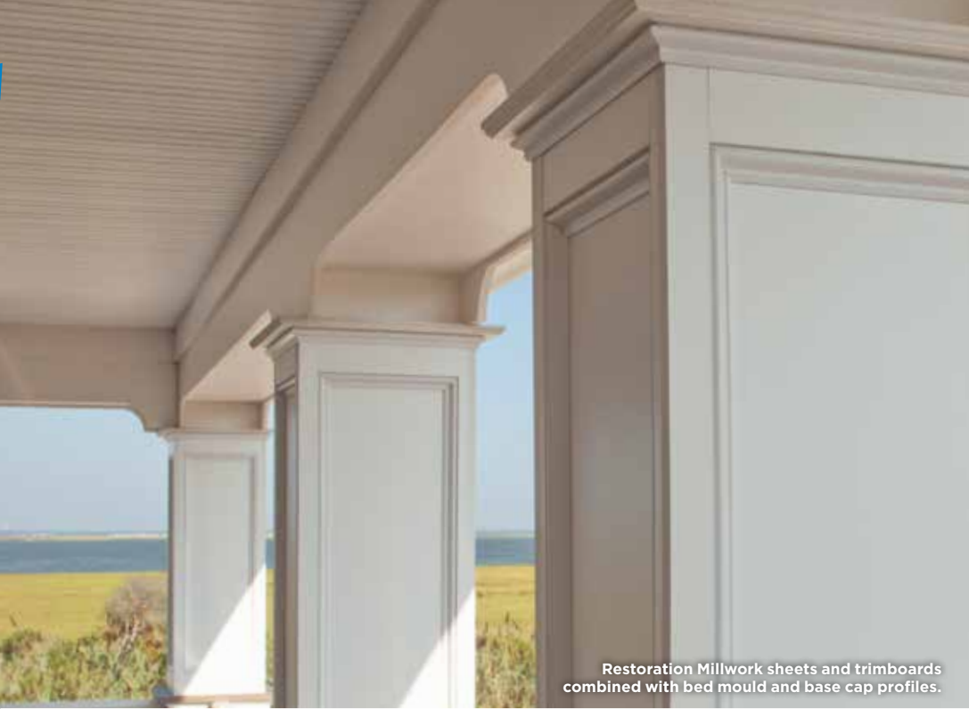
Restoration Millwork sheets and trimboards combined with bed mould and base cap profiles.