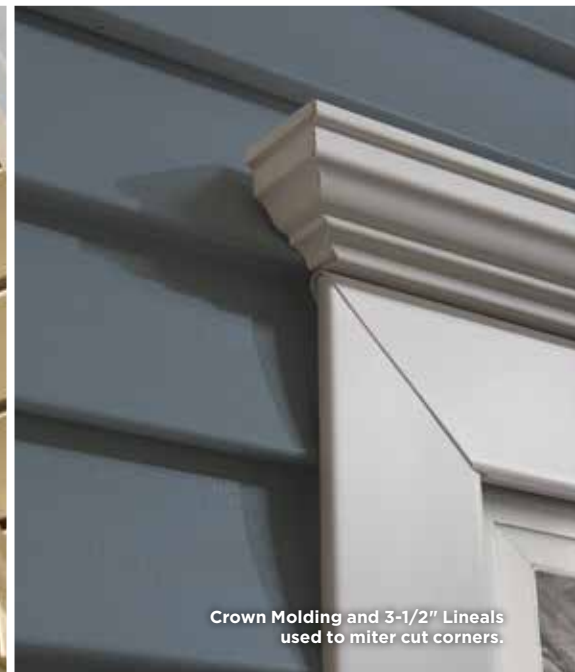
Crown Molding and 3-1/2" Lineals used to miter cut corners.