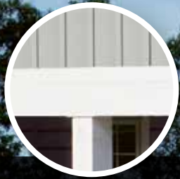
Restoration Millwork* trimboard*

CertainTeed Vinyl Carpentry and Restoration Millwork are used together to create an exterior with strong trim lines with offsetting colors. The extensive selection of colors in both trim lines can create borders that highlight the architectural textures of your home.