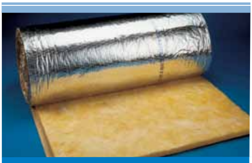
Standard duct wrap

smaller ducts with 1-inch metal straps. The contractor's biggest challenge came when hanging ductwork in the auditorium, which has sloped floors and a 40-foot structure above. To reach the structure. the crew used tall scissor lifts, but the sloped floors presented a difficulty, placing them at awkward angles during duct installation. The crew was able to overcome this obstacle, however, by using ramps.