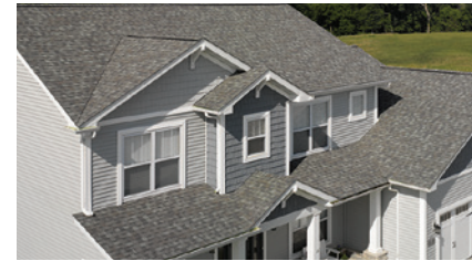
ROOFING AND VENTILATION