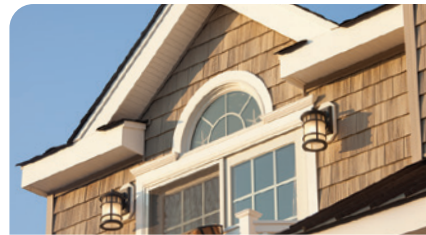
POLYMER SHAKES & SHINGLES

CertainTeed products are designed to work together and complement each other in color and style to give any home a beautiful, finished look.