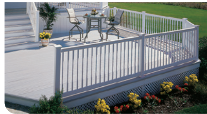
DECKING AND RAILING