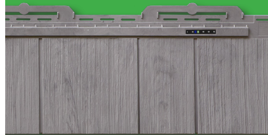
Cedar Impressions Single 7" Perfection Shingle panel.

Install Cedar Impressions single-course siding when coming up to the top of a wall. Use an accent like Cedar Impressions single-course siding or Cedar Impressions Perfection Shapes in a gable using a different color.