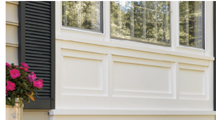
PVC EXTERIOR TRIM & BEADBOARD