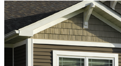
VINYL CARPENTRY ® TRIM