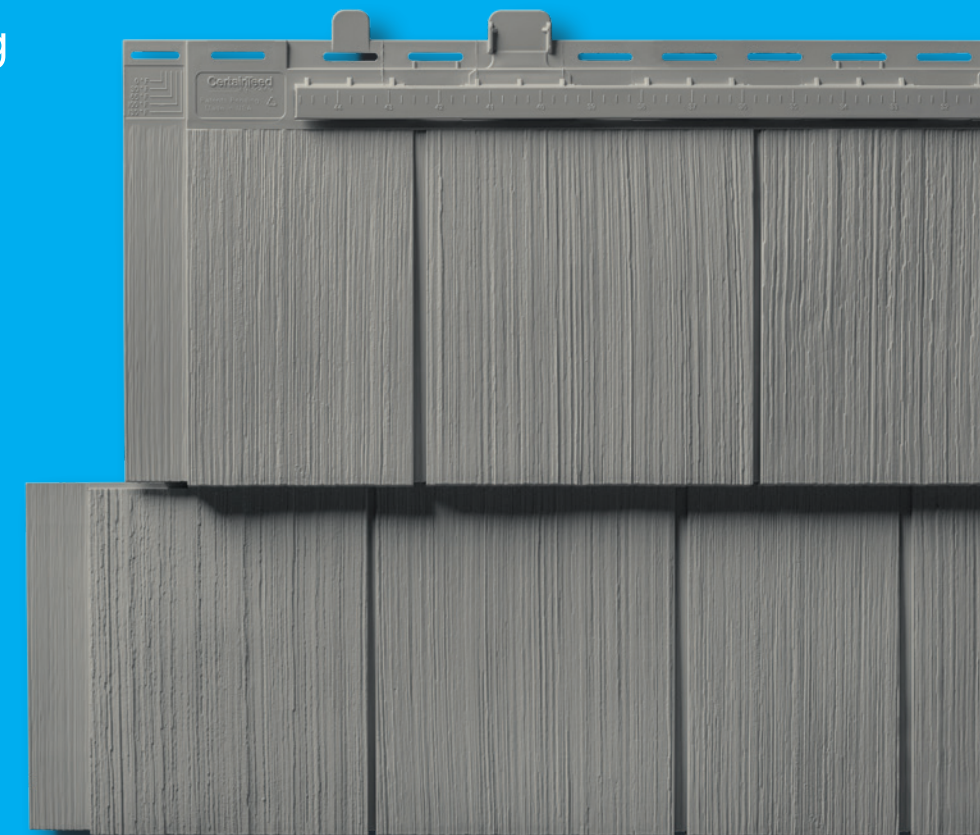
Cedar Impressions Double 7" Perfection Shingle panel.

A double-course siding panel covers 4.55 square feet per panel, versus 3.5 square feet per panel for single-course siding – an improvement of 30% in coverage area.