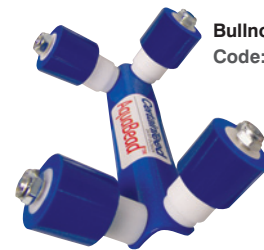
Bullnose Roller Code: 315159