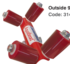
Outside 90° Code: 314066

CertainTeed AquaBead® Rollers—designed exclusively for Outside 90° and Bullnose. AquaBead Rollers press corners firmly and accurately into place, creating an absolute bond to the drywall. Drywall corner installations are faster and easier, delivering bottom-line savings on labor and mud. Designed for Outside 90° and Bullnose.